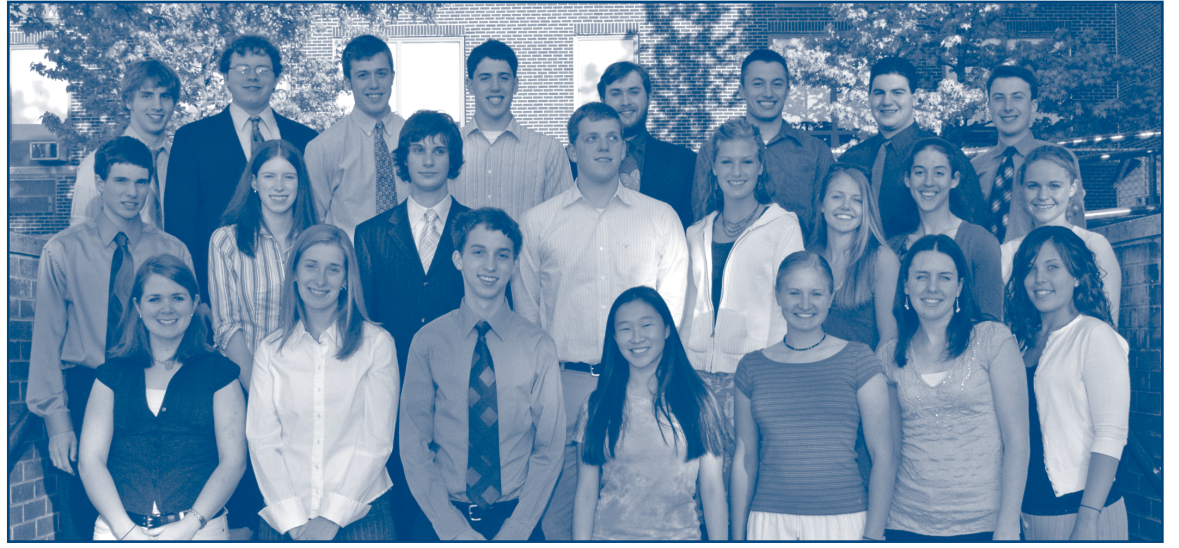
Senior Scholars - Members of the class of 2006 at SAHS, who are in the top five percent academically, were honored at the school's annual Scholar's Banquet.

The district has implemented technology to establish both wide-area networks and local area networks. Every classroom has access to the Internet and is governed by an Internet Use Policy. Laptop labs and Smart Boards are used in the elementary schools. Secondary schools have between four and six computer labs; elementary schools have one lab. All schools have multimedia workstation and libraries have access to electronic databases. Technology is used to support core curriculum, extend learning and help students create/express what they have learned in a variety of formats. A technology staff of 15 persons administers, maintains, and helps coach teachers in use of technology to support student learning. SASD has six technology teachers who both teach and coach teachers for technology integration.