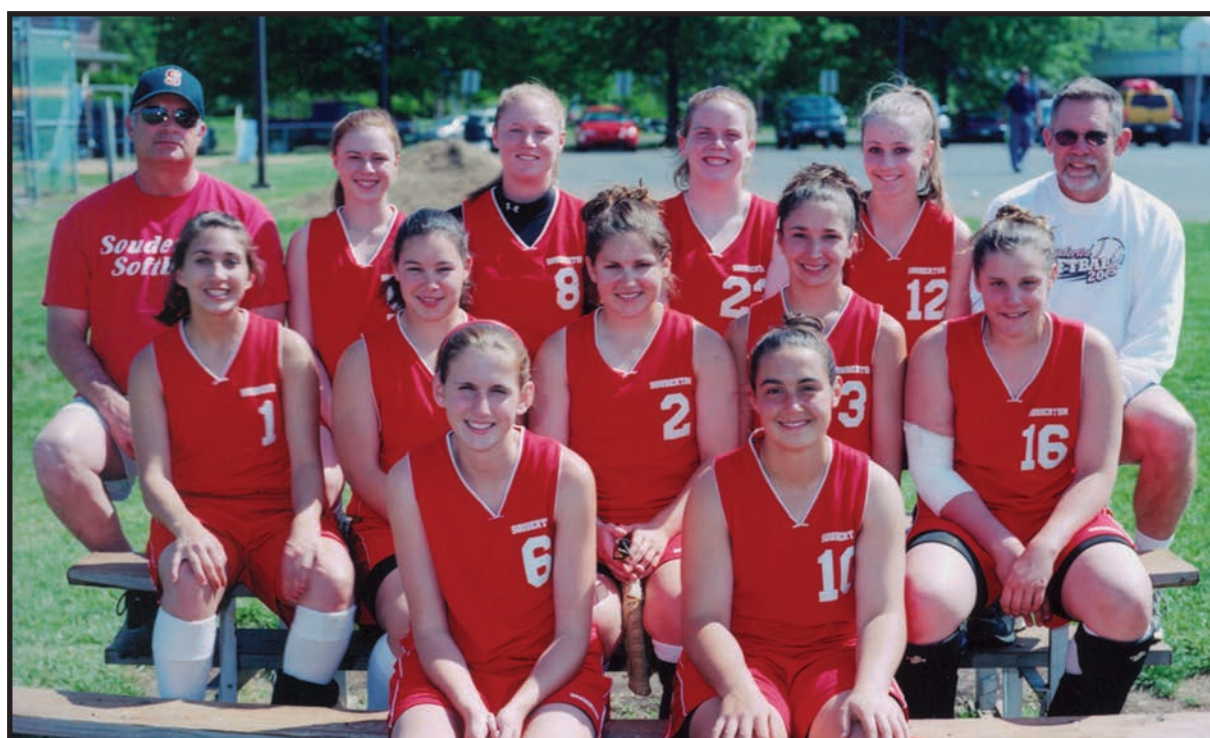
Souderton Area High School Girls Softball Team - PIAA State Semi-Finalists - 2006